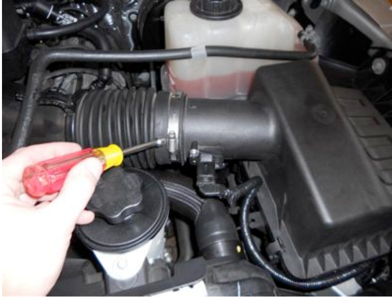
CLIPS ON STOCK LID

REMOVE FACTORY CLAMP ,3 CLIPS ON STOCK AIR LID, MAF SENSOR CONNECTOR AND LIFT FATORY LID AND FILTER OUT.